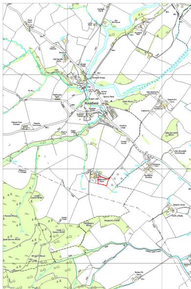
Reproduced by permission of Ordnance Survey on behalf of HMSO. © Crown Copyright and database right 2005. All rights reserved. Ordnance Survey License number: 100016400.